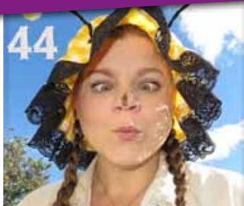
The Bee Lady from Auckland