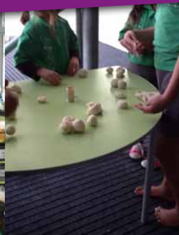
Salt Dough Bee Modelling